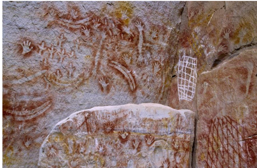
Carnarvon Gorge Rock paintings

The Department of Environment, Science and Innovation acknowledges the First Nations peoples across Queensland. We pay our respect to Elders, past and present. We acknowledge the continuous living culture of First Nations Queenslanders—their diverse languages, customs and traditions, knowledges and systems. We acknowledge the deep relationship, connection and responsibility to land, water and sky Country as an integral element of First Nations identity and culture. This Country is sacred. Everything on the land has meaning and all people are one with it. We acknowledge First Nations peoples' sacred connection as central to culture and being. First Nations people speak to Country, listen to Country, sing up Country, dance up Country, understand Country and long for Country. We acknowledge and thank First Nations people for the enduring relationship connecting people, Country and ancestors—an unbreakable bond that safely stewarded and protected the land, waters and sky for thousands of generations.