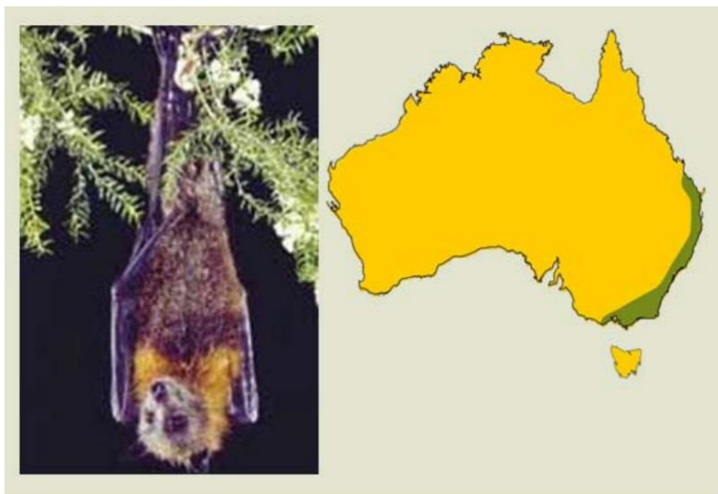
Figure 3. Grey-headed flying-fox