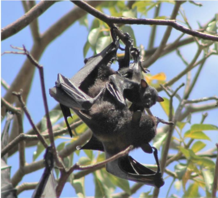
Figure 5. Black flying-fox showing young in armpit