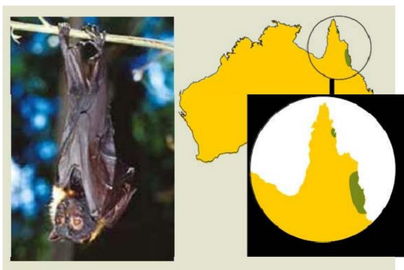
Figure 4. Spectacled flying-fox

N.B. Although the spectacled flying-fox occurs in Queensland, due to its listing as a threatened species under the Nature Conservation Act 1992 , a damage mitigation permit cannot be granted for its lethal take unless specifically authorised under a conservation plan.