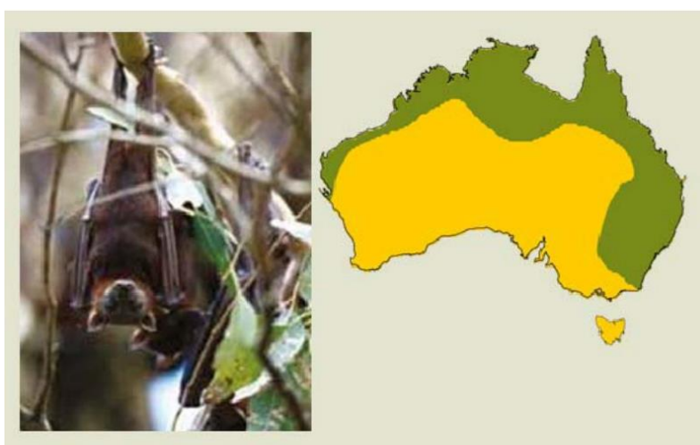
Figure 1. Little red flying-fox