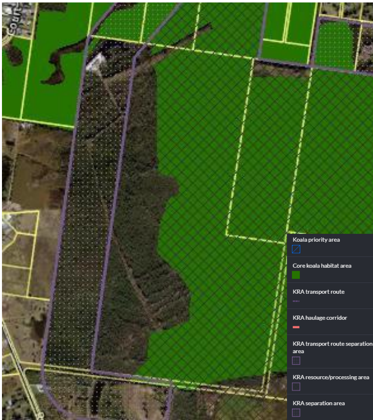
Figure 1: Example of an area that is in a key resource area and is mapped as containing a koala habitat area that is outside of a koala priority area