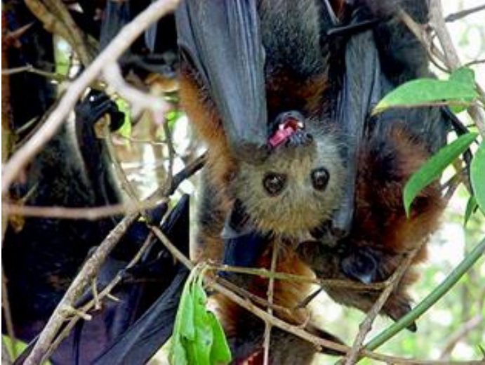
Figure 5 Wrist licking