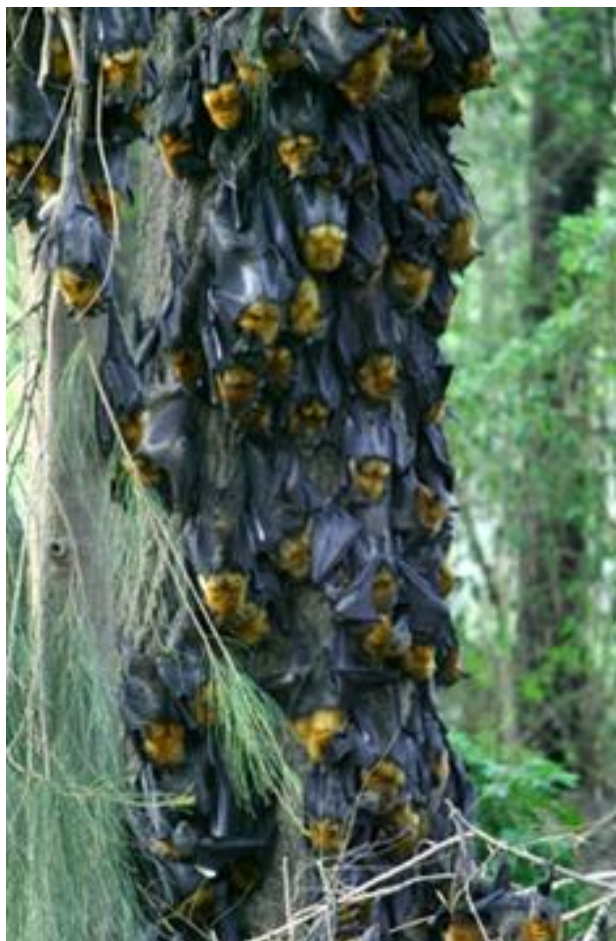
Figure 4 Clumping