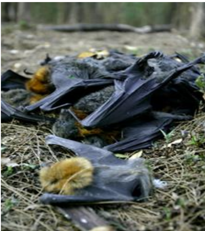
Figure 6 Collapse