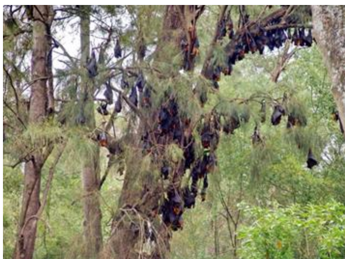
Figure 3 Clustering